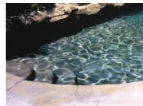
Above: Creating a natural pool landscape on a sloping site was a challenge for Recreation Development. The company specializes in water features, themed environments, pools, spas and artificial rock work.

For further information, contact Recreation Development Company, 3255 Losee Rd, North Las Vegas, NV 89030, phone (702) 399 7955, fax (702) 399 7954. Website: www.recdev.com.