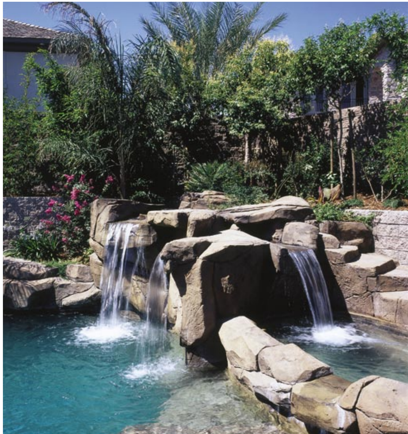
Above: Lewis Landscape designed and installed the landscaping for the Kuykendall property. The pool area includes a waterfall and stepping stones. Neighboring trees help provide a lush, green backdrop. The company also designed retaining walls and terraces to accommodate the gradient of the land.

A house designed for entertaining needs an outdoor focus, especially when it's located in a city with a sunny climate. For the Kuykendall house, a natural setting, complete with pool and waterfall, was designed by Lewis Landscape.