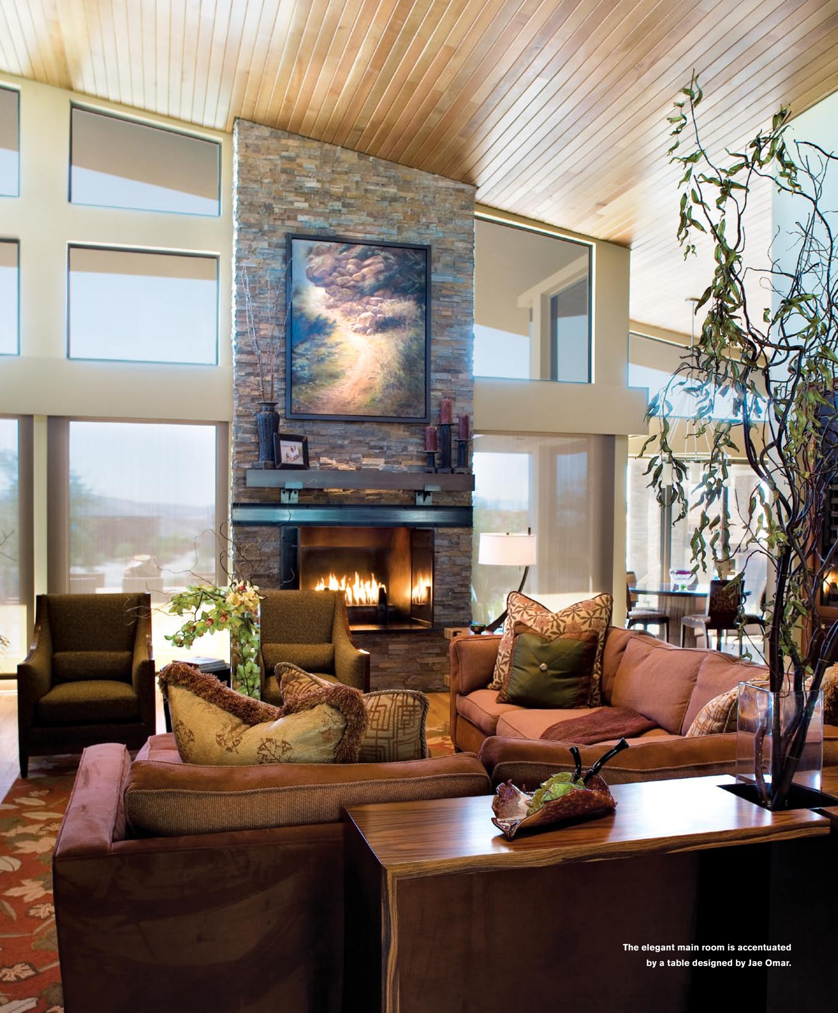
The elegant main room is accentuated by a table designed by Jae Omar.